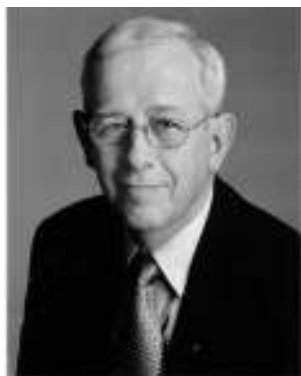
Emmet Stagg T.D.