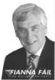
Michael Fitzpatrick T.D.