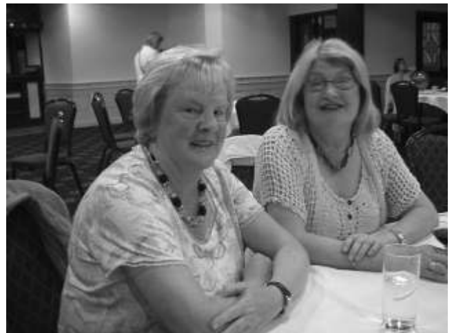
Taking a break from the dancing at the Big Band Revival night