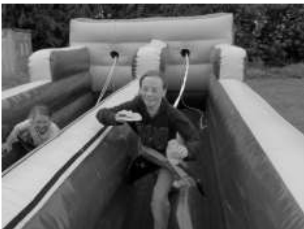
Having fun on the Bungee run