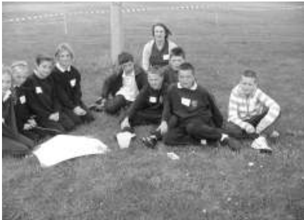
Group 14 Maynooth Red Socks awaiting instruction to participate with the 126 students in attendance