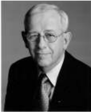
Emmet Stagg T.D.