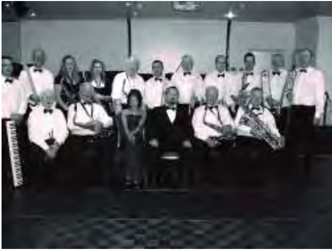
The Big Band Revival