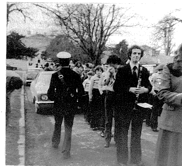
Boy Scouts in St. Patrick's Day Parade.