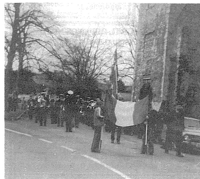
St. Patrick's Day Parade in Maynooth.