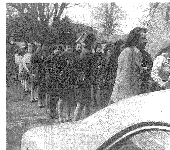
Girl Guides in St. Patrick's Day Parade