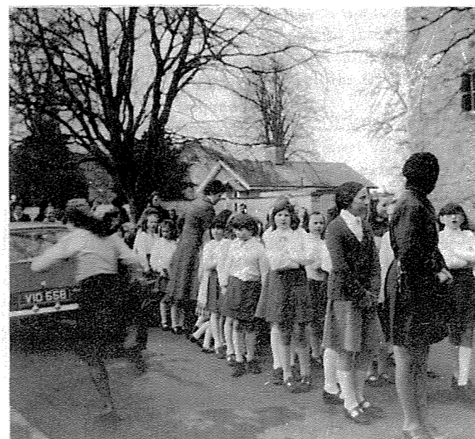
Irish Dancers in St. Patrick's Day Parade .